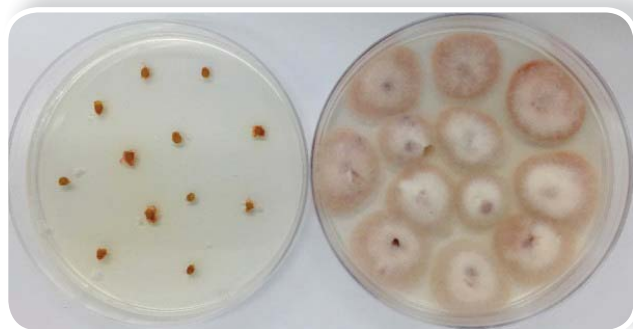
Fusarium oxysporum f. sp. lycopersici race 3 was recovered from seeds harvested from infected plants in commercial fields. Seeds were plated directly onto selective media for Fusarium spp.

So, “maybe [cleaning] cannot be perfect,” Miyao says. “But doing things to reduce the pathogen load before moving to another field just makes sense.”